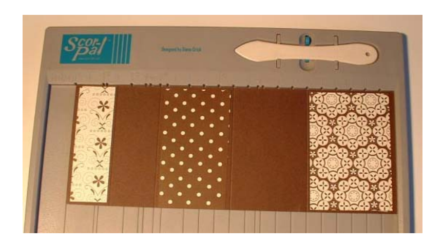
<u>Step2:</u> Attach the decorator paper while the cardstock is flat. The first panel is 1\frac{1}{4} " x 4" (left side) - Second panel is 2\frac{1}{4} " x 4" Third panel is 2\frac{3}{4} " x 4" Now you can fold the accordion pleats!